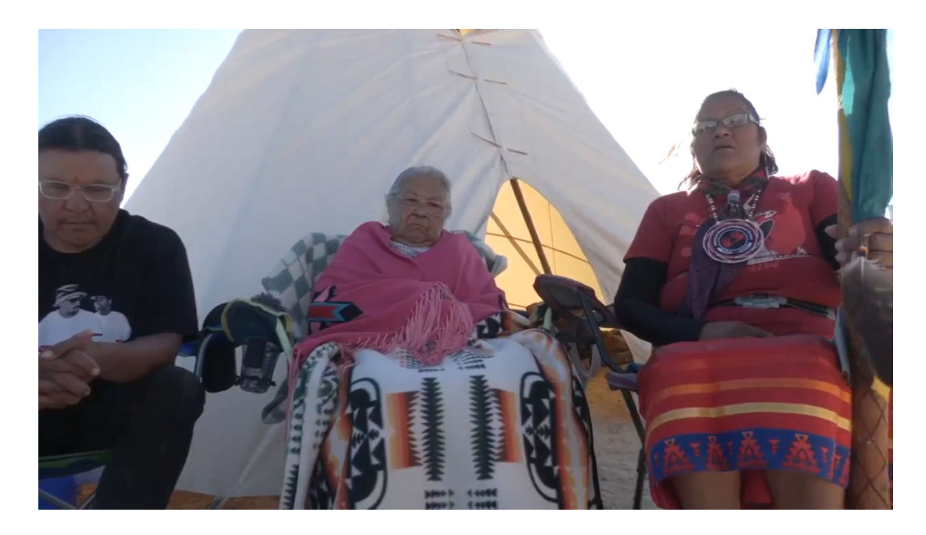
Figure 6: Lakota activist Chase Iron Eyes joins the Numu "camp grandmas" for a day of prayer and nonviolent resistance in the path of the Thacker Pass Lithium Mine on May 12, 2023.

The history of violence at Thacker Pass/Peehee mu'huh is central to the Native-led opposition of the lithium mine, but, critically, it is more of a footnote to federal agencies and Lithium Nevada. Through the course of the controversy, this history has been dismissed and called into question in both the governmental and public discourses on the topic. The result was a legal and public debate over the 1865 massacre and more broadly, the continued lack of acknowledgement or protection of sites of historic trauma for living Native peoples, peoples whose inherited attachment to place spans back to time immemorial. In this contest over Thacker Pass, there's a visible and well-organized effort on the part of tribal community members and their allies to reclaim the narrative to more fully include their past and cultural beliefs into decisions regarding the way land is used. The activists and elders of the Thacker Pass movement