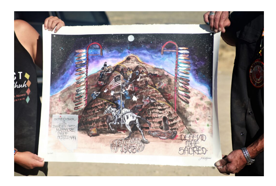
Figure 8: An artist's rendition of the 1865 massacre, showing soldiers flying an American flag shooting into wickiups. Sentinel Rock is visible in the foreground.<sup>226</sup>

importance of their land-based histories in the decision-making over the use of the lands and its resources.