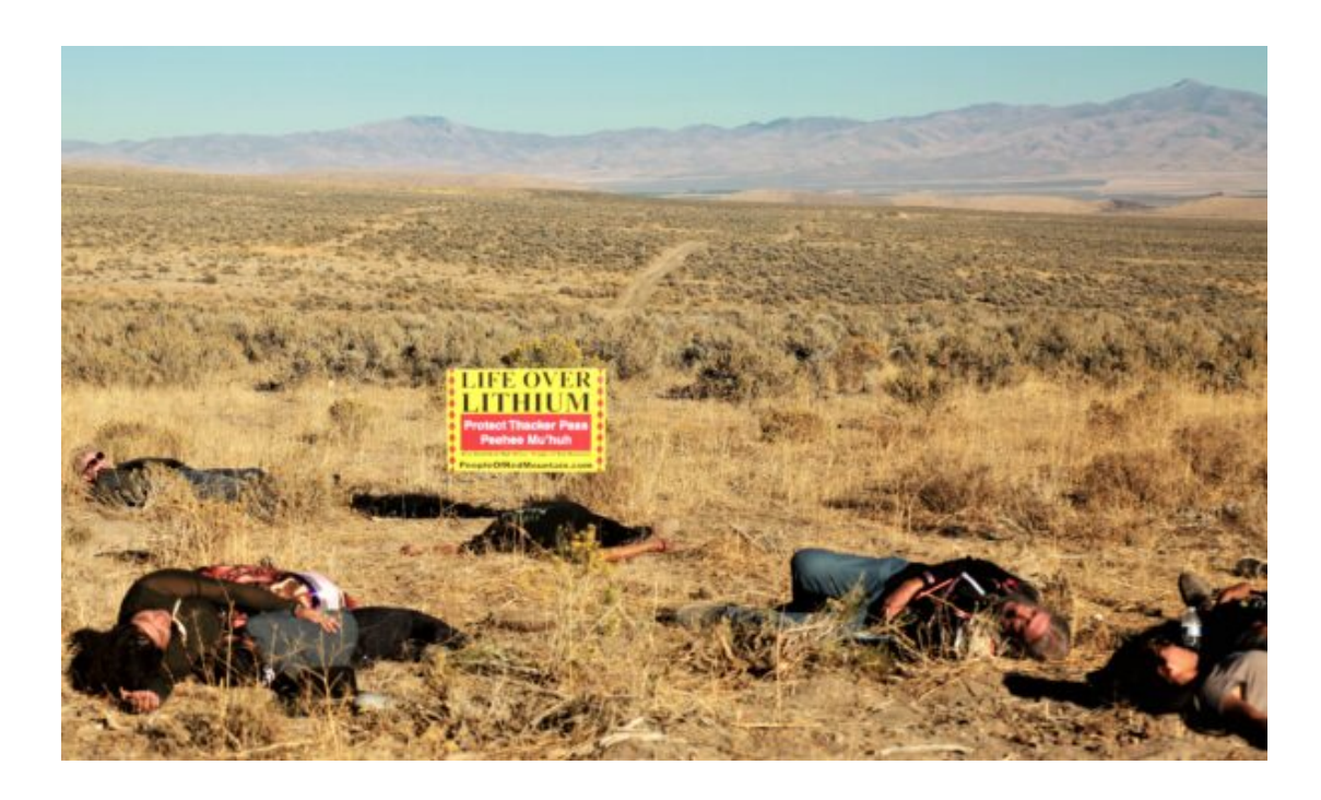
Figure 5: Indigenous people and allies, resisting the Thacker Pass Lithium Mine, stage a "die in" protest at the site to bring attention to the land's history as the place of massacres that left their ancestors unburied in the Pass.

While Thacker Pass hosted different uses through the twentieth century, it was not until very recently in the twenty-first century that the location gained significant notoriety outside of local and Indigenous communities. Beginning in 2017, people in national and international spaces start to acknowledge Thacker Pass for its exceptional abundance of lithium, a critical mineral in today's increasingly electrified society. Newspapers, magazines, and blogs—particularly those writing within a climate tech or green investment beat—pick up the story as an optimistic signal toward a future powered by clean energy. But it was not long into the project's development that Thacker Pass became the central location in a public debate about the historical significance of the grounds planned for extraction. Several groups mounted an opposition to the project citing cultural and environmental concerns following its speedy approval in 2021. Some of the opponents to the mine are local ranchers or environmentalists looking to conserve the land, and some are Numu, Newe, and Bannock community members