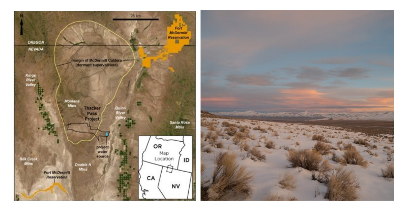
Figure 1 & 2: Lithium Americas' Map of Thacker Pass Project (left) shows the relation of the mine to the McDermitt Caldera, nearby mountains, state lines, cities, and reservation boundaries. Right, the Thacker Pass landscape covered in snow.

geologic and ecological history that informs the spiritual and material history of local Native people, as well as its presentist context as a place of conflict and historic trauma.